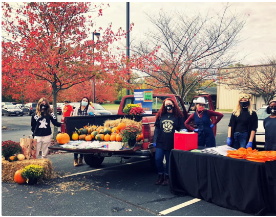
Fall Family Trunk or Treat Event