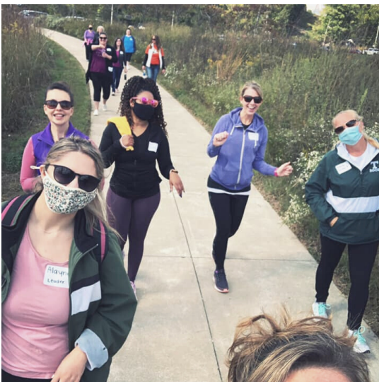
2020 FALL SPECIAL NEEDS MOMS HIKE & PICNIC