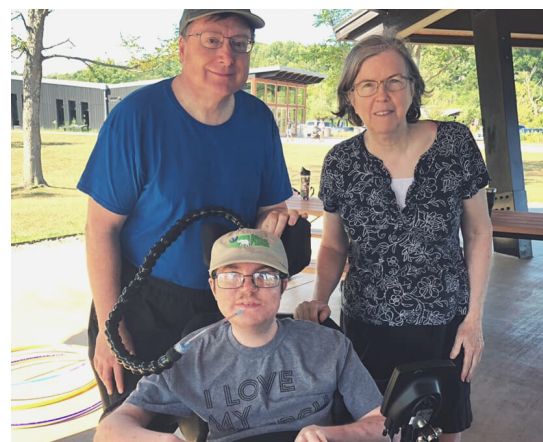
Special Needs Family Picnic